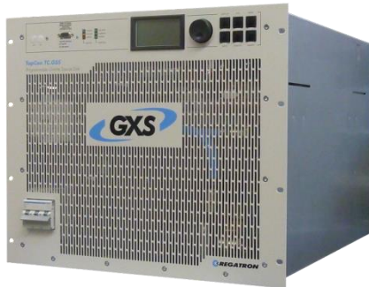
TC.GXS Series unit with optional Human Machine Interface (HMI)