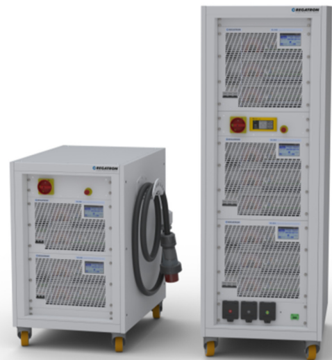
Figure 4: REGATRON's rack-integrated turn-key system solutions, e.g., 72 kW (left) and 162 kW (right) power levels. Various types of AC/DC connectors and cables allow for comfortable handling. Third-party product integration and numerous safety options are additional features.