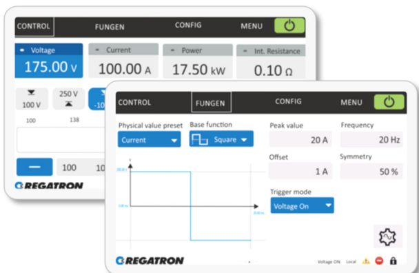
Figure 3: Intuitive control by HMI touch display. Everything you need at a glance.

The HMI built into the front panel allows comprehensive and convenient operation of the power supply via touch display.